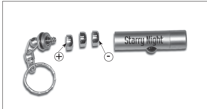
Figure 1. The positive (+) side of all three batteries should face the key chain end (or back) of the light, and the negative (-) side of the batteries should face the LED end (or front) of the light.

To install (or replace) the batteries, unscrew the end cap that the key chain is attached to. Insert three fresh batteries, each with positive (+) side up (see Figure 1 ). Upon screwing the end cap back on the light, battery installation is complete.